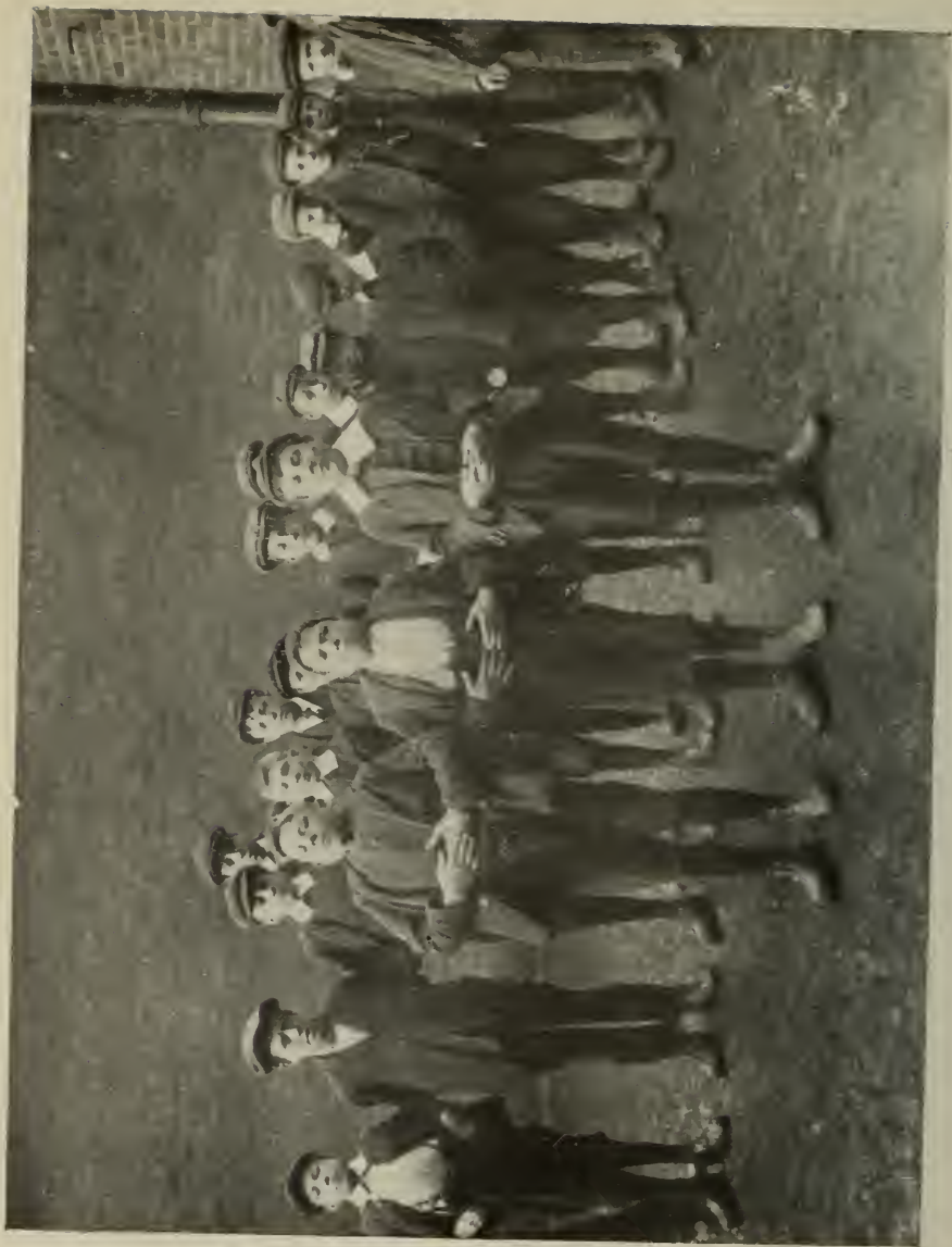
SEE NOTE ON FRONT OF PAGE